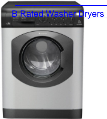
B Rated Washer Dryers

New products coming soon... Contact us if you need help with this credit