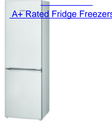
A+ Rated Fridge Freezers