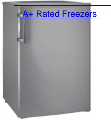
A+ Rated Freezers