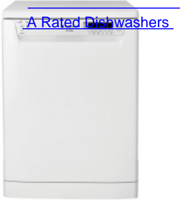
A Rated Dishwashers