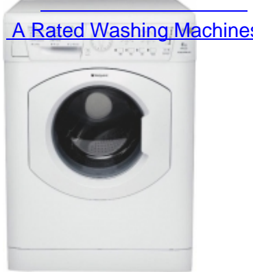
A Rated Washing Machines