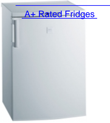
A+ Rated Fridges